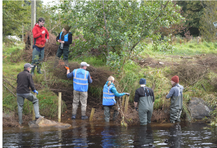
Goal 2: Nature-based Solutions

To implement innovative NBS projects which enhance and improve our local environment.