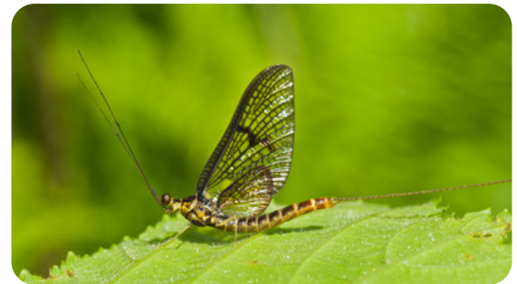
Wetlands attract a wide range of wildlife and provide excellent opportunities for teaching children about water.