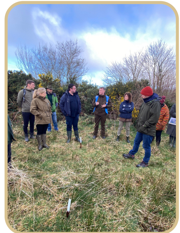
Discussing wetlands creation at Sharagore